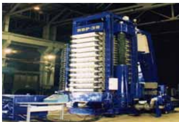
Automatic filter press with endless filter belt

We can provide these fabrics either as roll goods or as ready made items. In our own making-up department we can also produce filter belts with clipper seams and edge reinforcements.