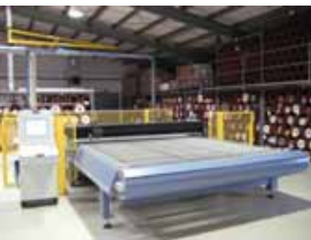
The new all-rounder Mercury 603

We will gladly demonstrate our capabilities, if requested, with your material.