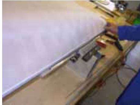
Appliance for fitting of stainless steel clippers

In addition to that we can provide stamped parts by using our own laser cutter or ultrasound machine as well as high-frequency welding and stamping and even commission cutting.